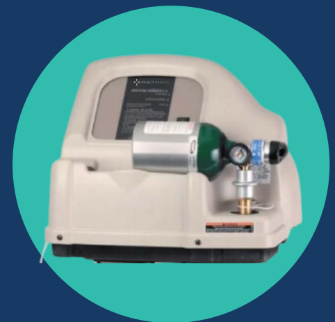
HomeFill Equipment /Cylinders

*Your email will not be utilized for other marketing purposes.