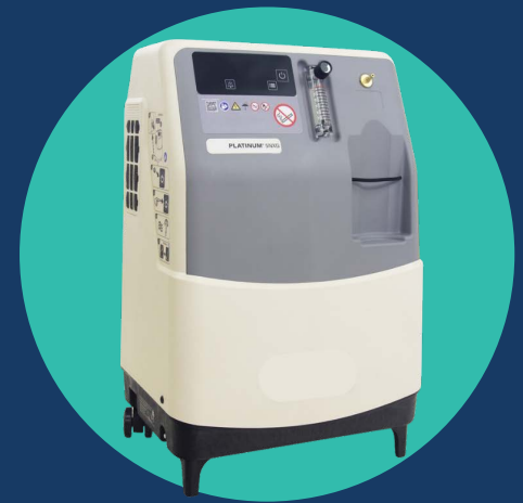
Platinum 5NXG Stationary Concentrator