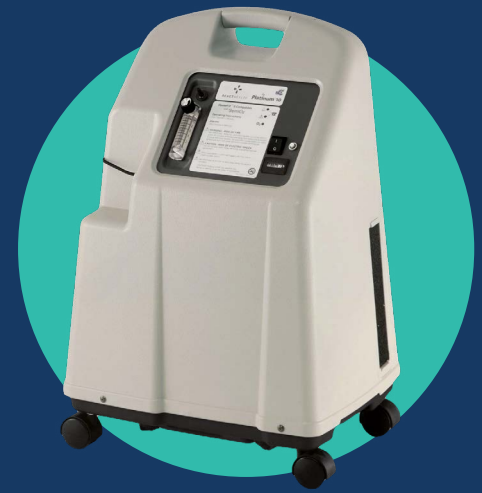
Platinum 10L Stationary Concentrator

Invacare will not be responsible for Tech Support for RESPI products after ~July 30th, 2023. The Ventec Service team will be fielding these calls.