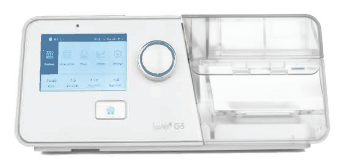
Luna G3 Bilevel 25A (LG3700) and Bilevel ST 30Vt (LG3800)