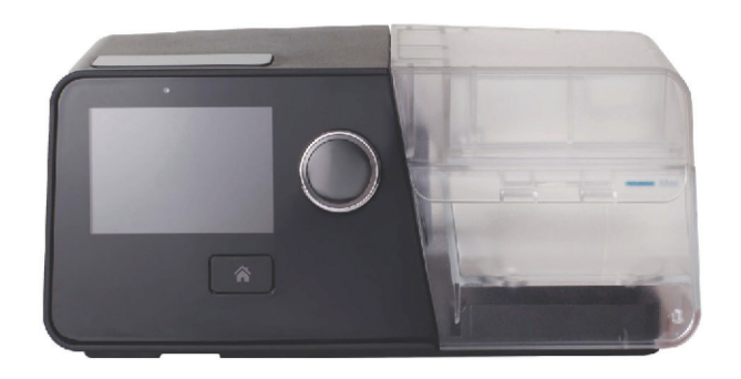
Luna G3 CPAP (LG3500) and APAP (LG3600)