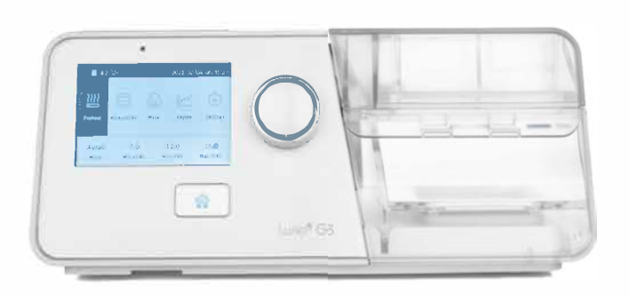
Luna G3 Bilevel 25A (LG3700) and Bilevel ST 30Vt (LG3800)