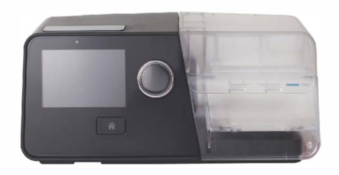
Luna G3 CPAP (LG3500) and APAP (LG3600)